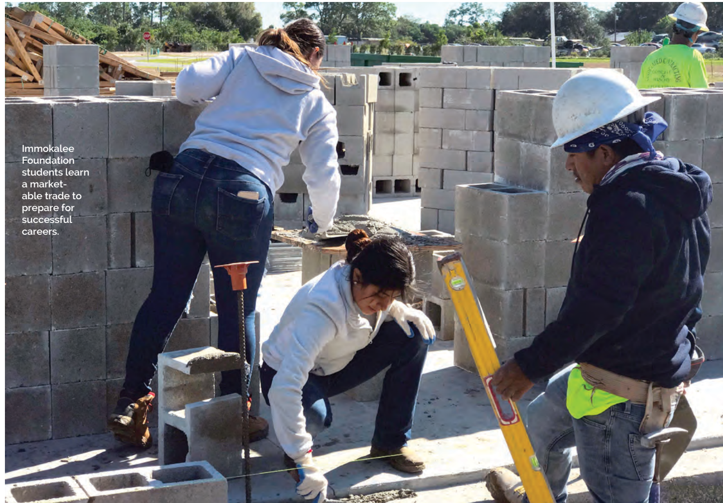
Immokalee Foundation students learn a marketable trade to prepare for successful careers.

Invest in powerful change to address critical needs through Your passion. Your Collier.