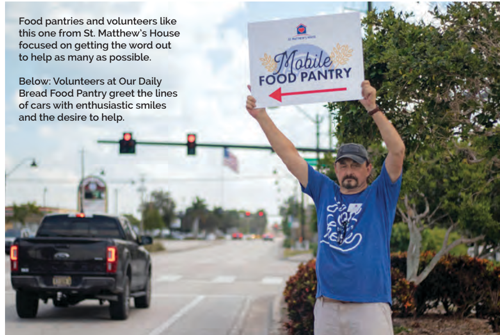
Food pantries and volunteers like this one from St. Matthew's House focused on getting the word out to help as many as possible.