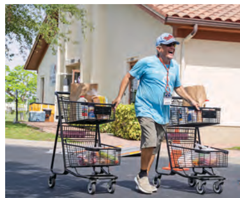
Below: Volunteers at Our Daily Bread Food Pantry greet the lines of cars with enthusiastic smiles and the desire to help.