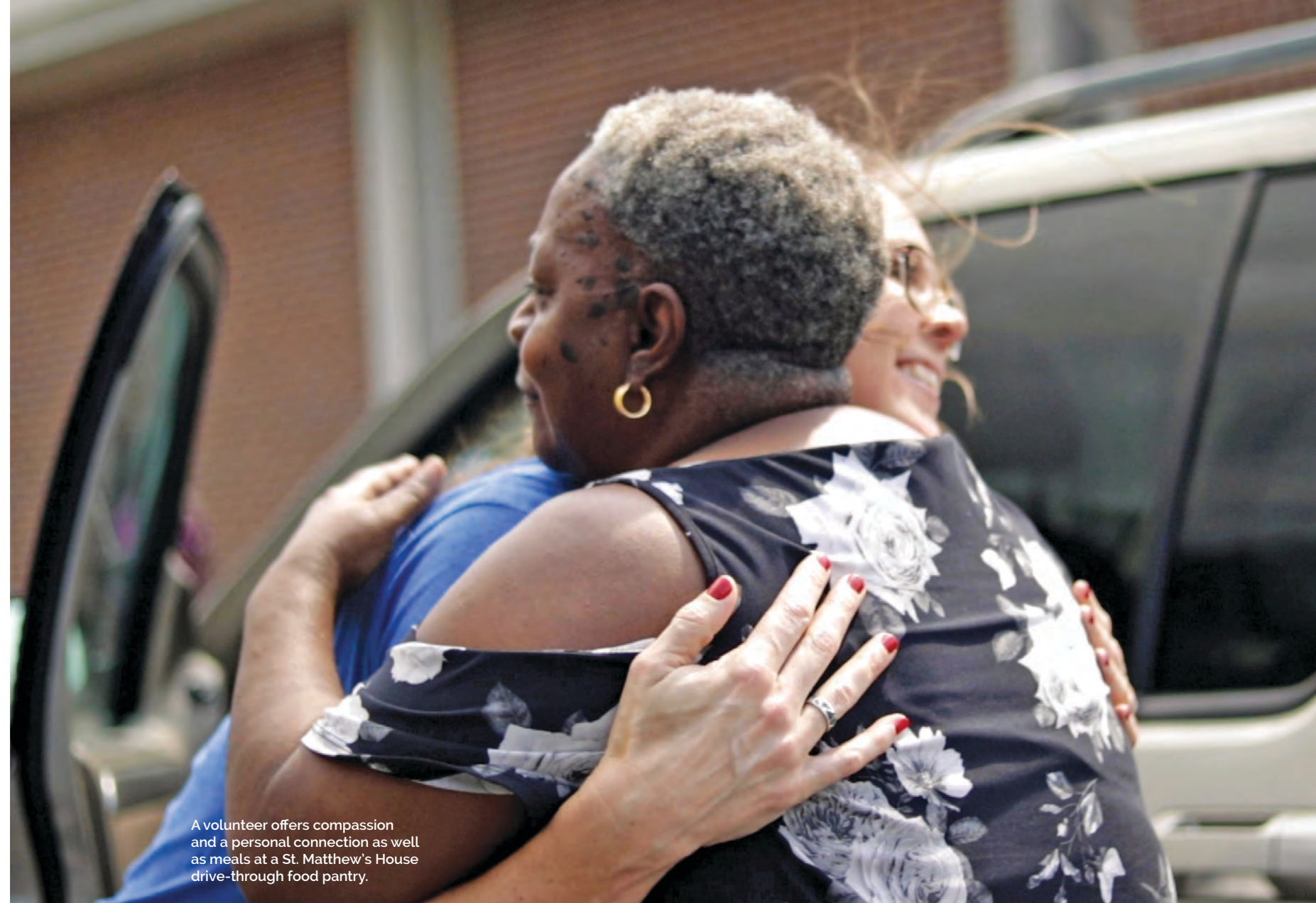
A volunteer offers compassion and a personal connection as well as meals at a St. Matthew's House drive-through food pantry.

Harry Chapin Food Bank of Southwest Florida has been distributing an average of a million pounds of food each week to roughly a