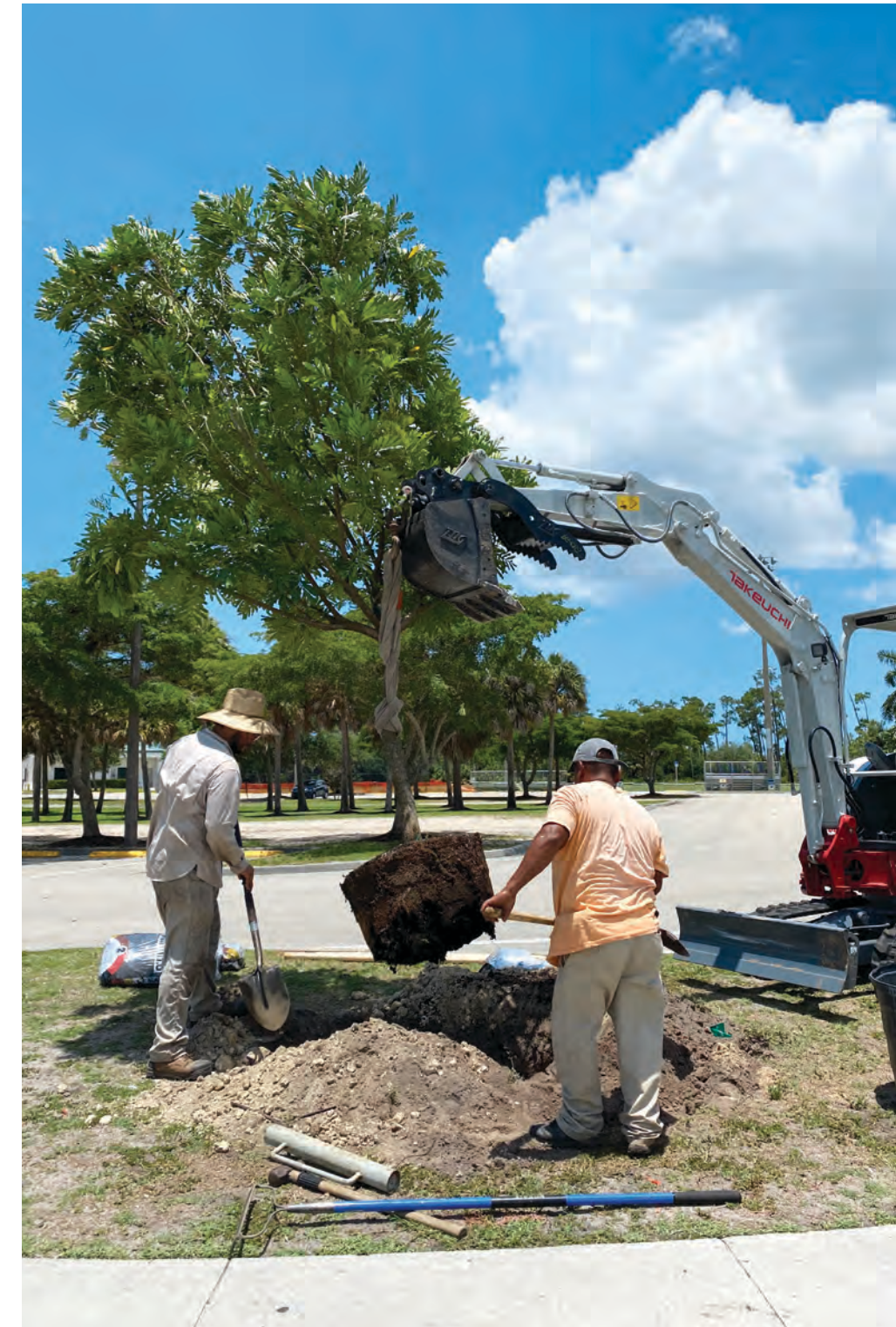
Naples Botanical Garden staff plant a Japanese fern tree at Donna Fiala Eagle Lakes Community Park in East Naples.

substance abuse, housing & hunger, education & employment, seniors & veterans, environment & accessibility, and crisis & disaster relief.